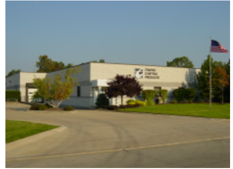
The Traffic Control Products building where Wapiti Micro Systems will now be located.